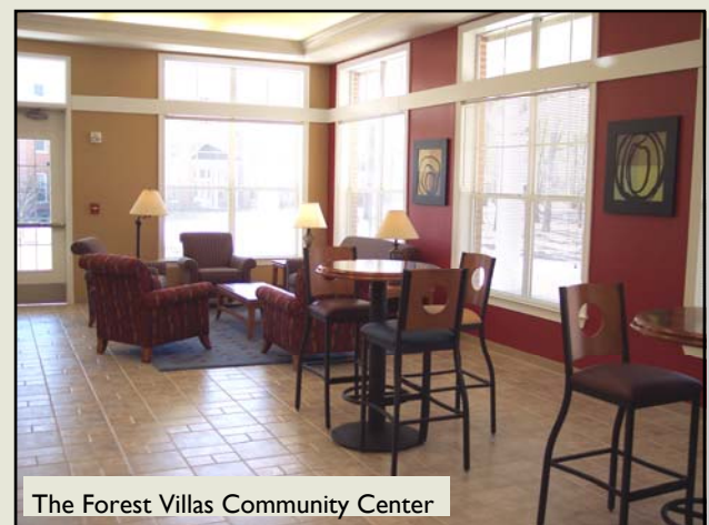
The Forest Villas Community Center