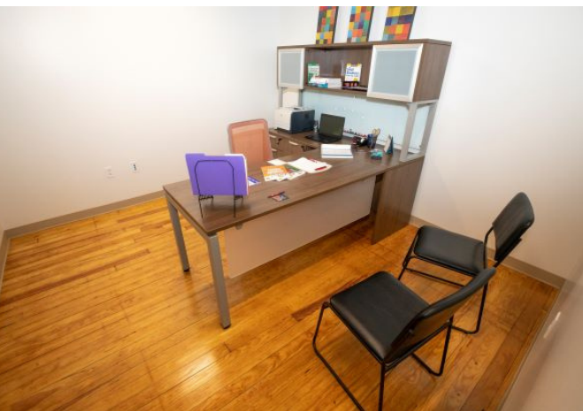
FMU University Place Private Office Space