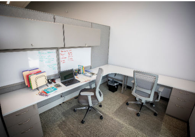
The Continuum Private Office Space

Our team is dedicated to providing resources and support for small businesses and entrepreneurs.