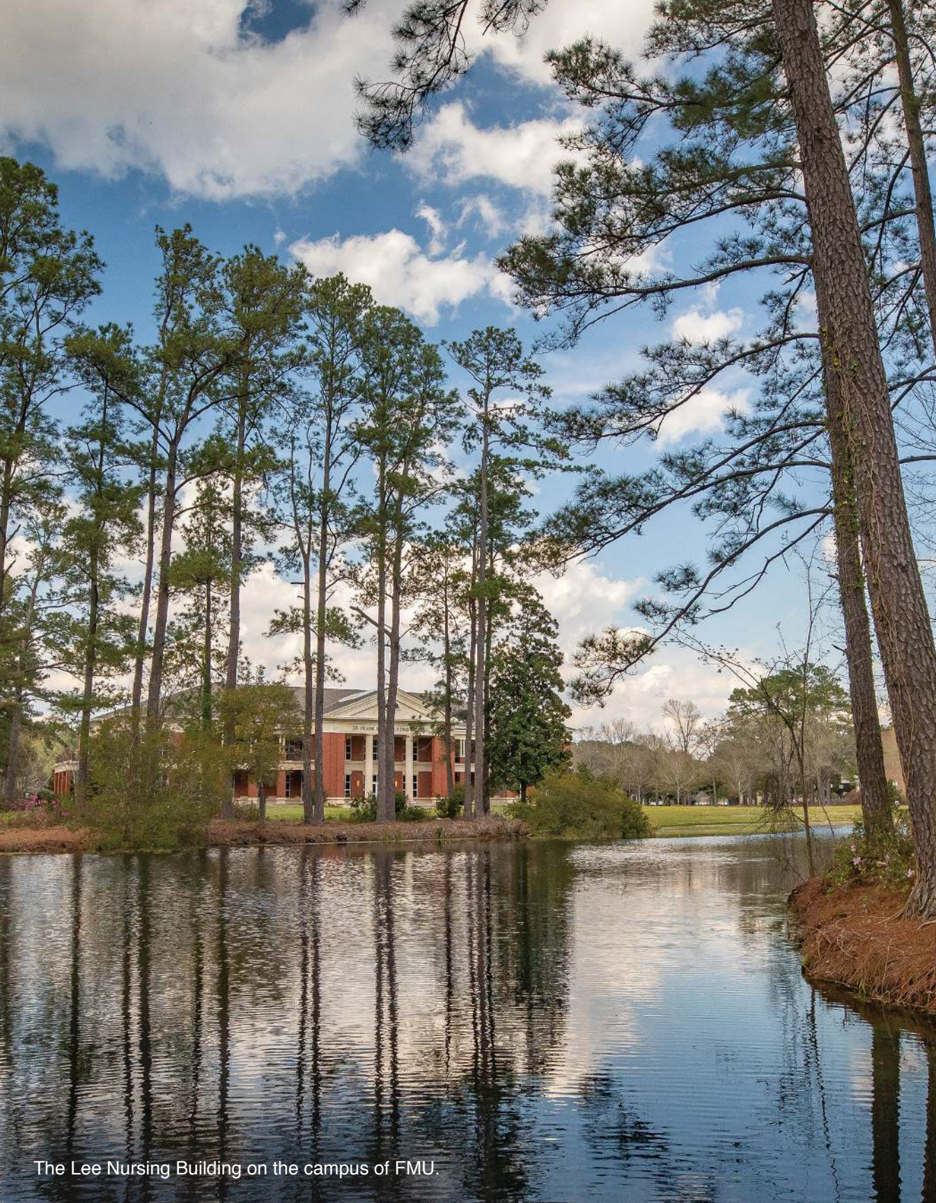
The Lee Nursing Building on the campus of FMU.