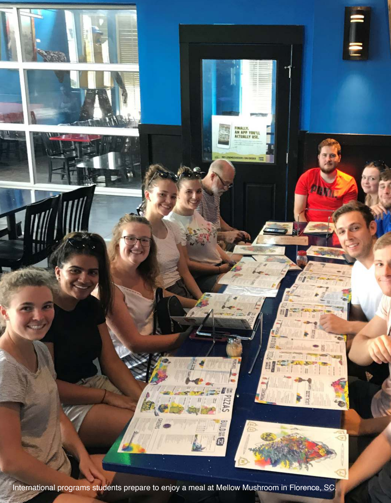
International programs students prepare to enjoy a meal at Mellow Mushroom in Florence, SC.