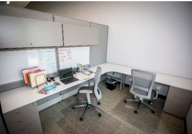
Lake City Incuabtor Office Space

We are dedicated to helping small business owners and entrepreneurs maintain and reach their business goals.