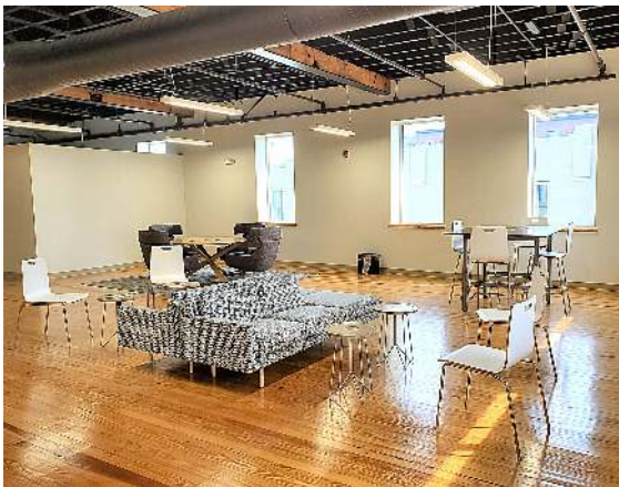
Florence Incubator Community Space

We help entrepreneurs, start-ups, and small business owners in the Pee Dee Region to maintain and reach their business goals.